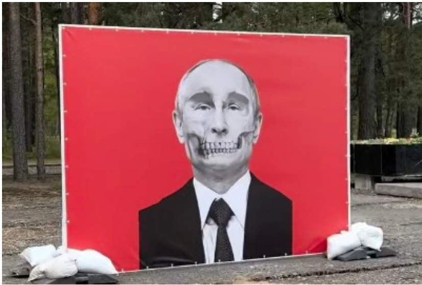
Poster Putin

How else than as a provocation should the ethnic Russians have perceived this installation at this location? Long-suffering and wise, the mourners kept their composure and laid their flowers extensively across several areas of the spacious grounds. That was what they had come for.