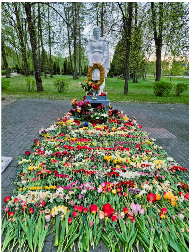
Salaspils Memorial, photo: Andrey Pagors. The statue shown is the monument to the children who died in the Salaspils camp (often also referred to as the monument of the mourning mother).

How else than as a provocation should the ethnic Russians have perceived this installation at this location? Long-suffering and wise, the mourners kept their composure and laid their flowers extensively across several areas of the spacious grounds. That was what they had come for.