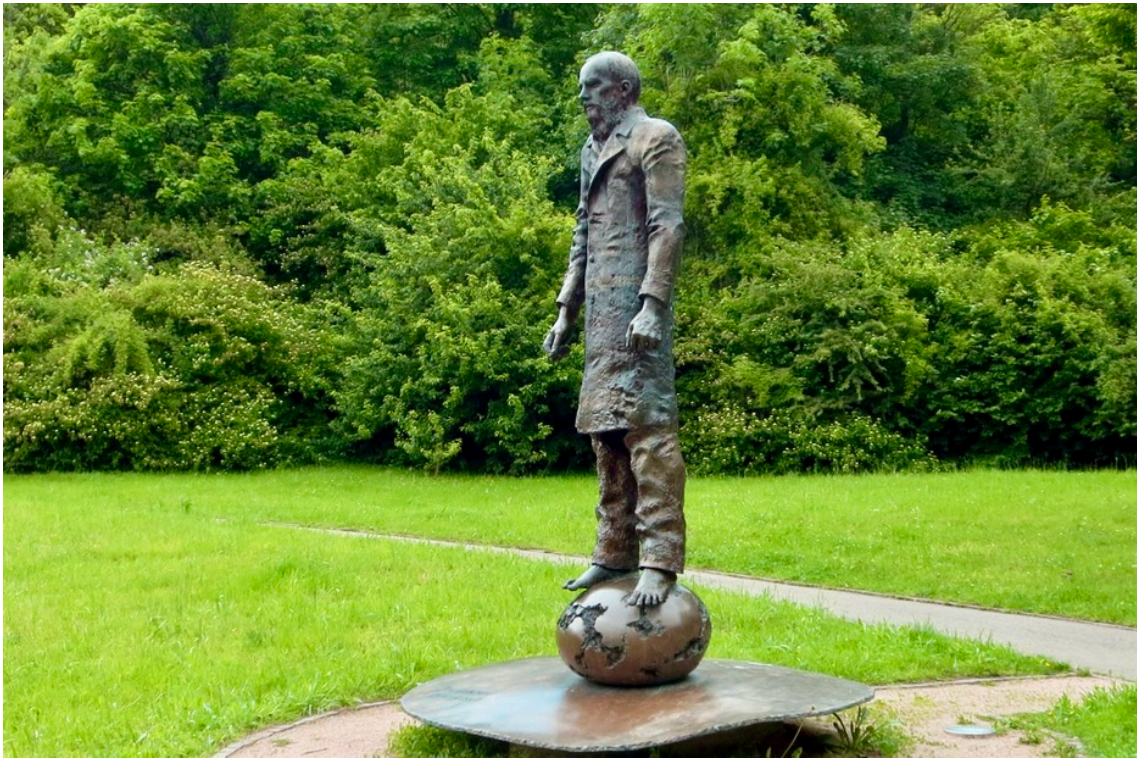
Dostoevsky in Baden-Baden, photo: Moritz Grenke, Licence CC-BY-SA4.0