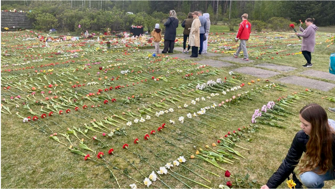
Salaspils Memorial

Both nationally and internationally, the voices of those Russians in Latvia who object to being labeled as Putin supporters remain completely unheard. Those who view it as a deliberate, aggressive falsification of history to equate the current policies of the Russian Federation with the Soviet Union. Latvia's government constructs a dull and stupid analogy: Whoever speaks Russian is a friend of Putin. Such instinctless, inflammatory simplifications are more suited to a fascistic regime than to the government of a democratic country, especially an EU member.